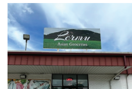
14. Lermu Asian Groceries 4236 Redman Ave

A grocery store with large varieties of groceries from various parts of the world, including South Asia.