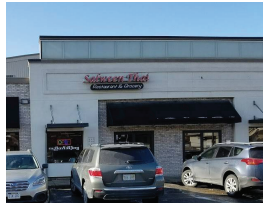
6. Salween Thai 1102 NW Radial Hwy

Founded by the Yoshu Win family. A traditional Thai restaurant in Omaha with 5 locations. Their first restaurant opened in 2012 at 1102 NW Radial Hwy.