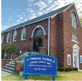
2. Karen Seventh-Day Adventist Church 3528 Burt St

The goal of the Karen Society of NE is to help Karen refugees and immigrants build a successful life in Omaha by helping them find jobs and education. The Karen Society of Nebraska assists with setting appointments, finding employment, reading mail, and filling out application forms for the Karen community.