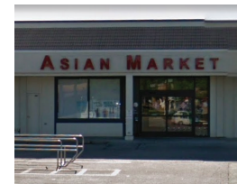
13. Asian Market 321 N 76th St

A grocery store commonly frequented by members of the Karen community.