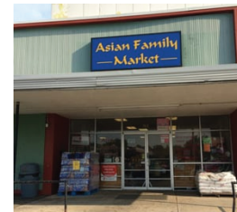
12. Asian Family Market 1510 NW Radial Hwy

A grocery store commonly frequented by members of the Karen community.