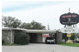
7. Salween Thai 6533 Ames Ave

Founded by the Yoshu Win family. A traditional Thai restaurant in Omaha with 5 locations. Their first restaurant opened in 2012 at 1102 NW Radial Hwy.