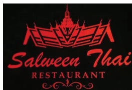
9. Salween Thai 9939 Redick Cir

Founded by the Yoshu Win family. A traditional Thai restaurant in Omaha with 5 locations. Their first restaurant opened in 2012 at 1102 NW Radial Hwy.