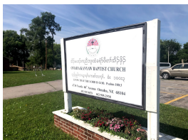
4. Omaha Kanyaw Baptist Church 4730 N 60th Ave

This Karen Buddhist Temple is part of the Karen Buddhist Society of Omaha. Outside of the temple there is a Buddha statue with a cement area in front of it. People will take off their shoes and lay a prayer rug on the cement to pray in front of Buddha.