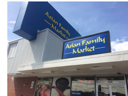
11. Asian Family Market 5934 Ames Ave

Opened for the 1964-65 school year, the school was named in honor of Richard Floyd Hartman. Many Karen children go to Hartman.