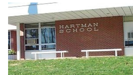
10. Hartman Elementary 5530 N 66th St

Founded by the Yoshu Win family. A traditional Thai restaurant in Omaha with 5 locations. Their first restaurant opened in 2012 at 1102 NW Radial Hwy.