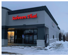
5. Salween Thai 14450 Eagle Run Dr

The Omaha Kanyaw Baptist Church has 500 members and 3 pastors. Their most attended service is their Sunday noon service, when women and youth join together to worship. The church focuses on teaching the Bible as well as the Karen language. The pastors wear traditional Karen shirts for every service as well as celebrating the Karen New Year at the church every year to uphold Karen traditions.