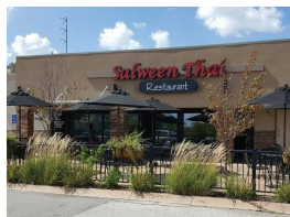
8. Salween Thai 7425 Pacific St

Founded by the Yoshu Win family. A traditional Thai restaurant in Omaha with 5 locations. Their first restaurant opened in 2012 at 1102 NW Radial Hwy.