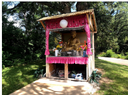
3. Talanya Buddha Vihara 9861 N 60th St

The Seventh-Day Adventists Church is a Christian community that holds services for Bible study, worship, and prayer. They have approximately 19 million members around the world and 1 million members in North America.