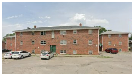
1. Karen Society of NE 816 N 44th St

The goal of the Karen Society of NE is to help Karen refugees and immigrants build a successful life in Omaha by helping them find jobs and education. The Karen Society of Nebraska assists with setting appointments, finding employment, reading mail, and filling out application forms for the Karen community.